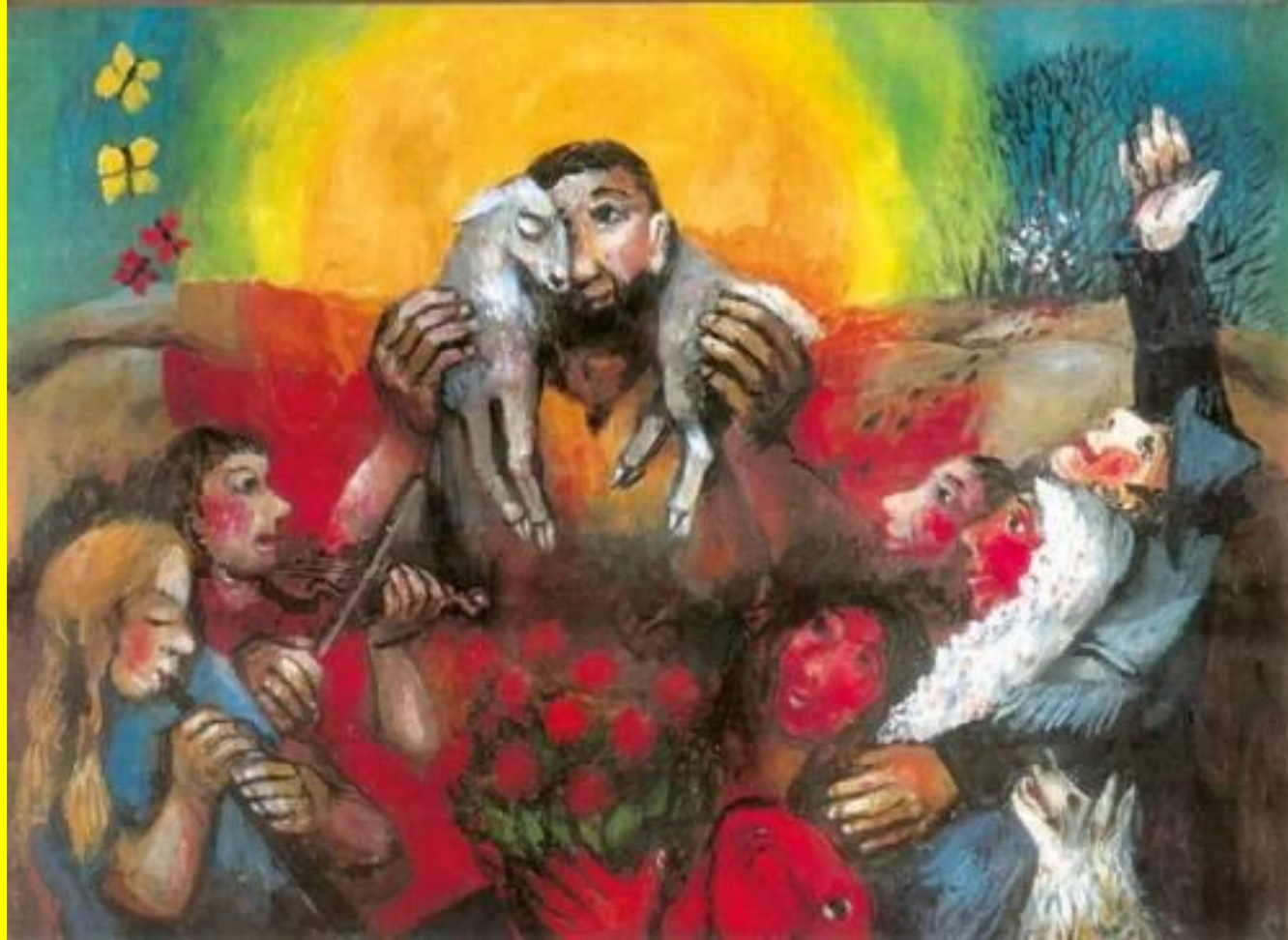
Christ the Good Shepherd Sieger Köder (Germany)